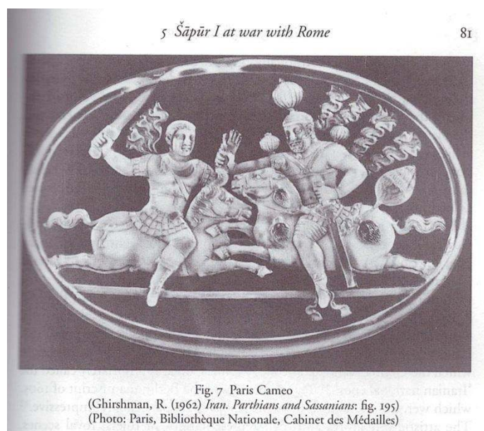
Figure 2: Shapur I captures Emperor Valarian

The world of late antiquity—not unlike the world of today—had a long history of east-west conflict. Fraught with tensions and fueled by old hatreds, the empires collided in continual warfare and conquest. The Parthians, originally nomads who emerged in the third century BC, were fierce. 28 Rome viewed their successors, the Sasanian dynasty, as a serious threat. 29 Initially, tensions had little to do with religion. In fact, early Christians went to Persia willingly. They were often safer and happier in the Parthian Empire, whose religious policy of non-interference protected them, than they were in the Roman Empire, where they were sent to the arena to die in droves. 30 It was not until after Zoroastrianism 31 was adopted by the Sasanian government in the late third century CE that Christians were treated with suspicion and violence. 32 Yet wars between Rome and Persia were primarily territorial in nature. 33 From the start, “it was above all the military confrontations that characterized Rome’s relations with her Eastern neighbors.” 34 Roman-Sasanian conflict was fierce even at the top. In 363 CE, Emperor Julian lost his life while advancing against Ktesiphon. 35 Many depictions exist of Valarian being captured by Shapur I. 36 From the top of society to the bottom, east-west conflict was fierce.