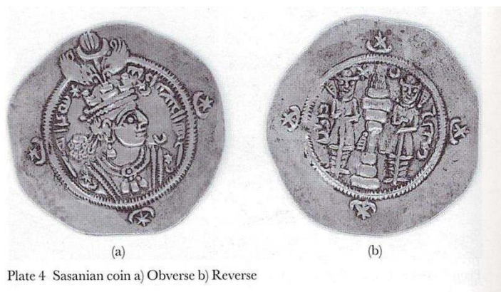
Plate 4 Sasanian coin a) Obverse b) Reverse

In spite of tensions, Persia and Rome traded with one another, even during wartime. Briefly, a treaty of 298 made Nisibis the only place of exchange between the east and west. But this bore little impact on shipping, and soon widespread trade resumed. 65 Numerous treaties, diplomatic frameworks, and customs duties between the powers made for a “regulated exchange of goods.” 66