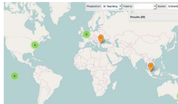
Figure 1: Evidence related to universities and teaching

The Evidence Hub mapping tool suggests that work on supporting teaching in universities with learning analytics is being developed and widely disseminated by only a few institutions. Figure 1 shows that almost all the evidence related to this proposition (represented by green circles) originates in a handful universities in the south of Australia, the west of Europe and the north-east of the USA. (The green circle in the Pacific Ocean represents studies associated with more than one area.) Outside these main areas, there are single pieces of evidence (represented by orange pins) in Singapore and Greece. As the LAK conference was receiving submissions from 31 countries by 2013 [63] and has since grown considerably, we might have expected to see evidence being produced and disseminated in many more countries.