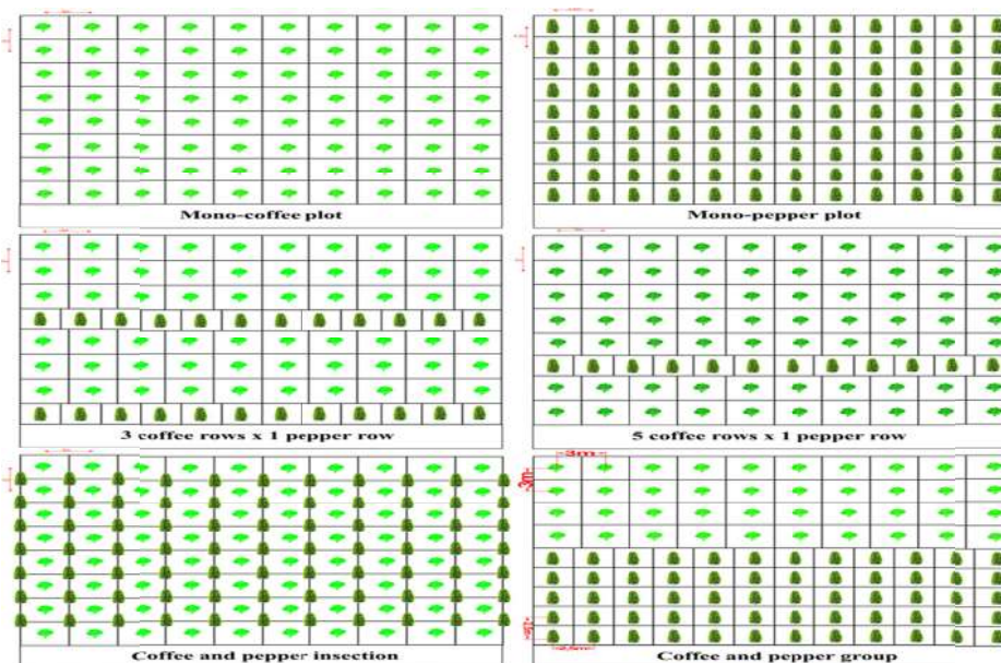
Figure 3. The space of coffee and pepper crops at different farm approaches