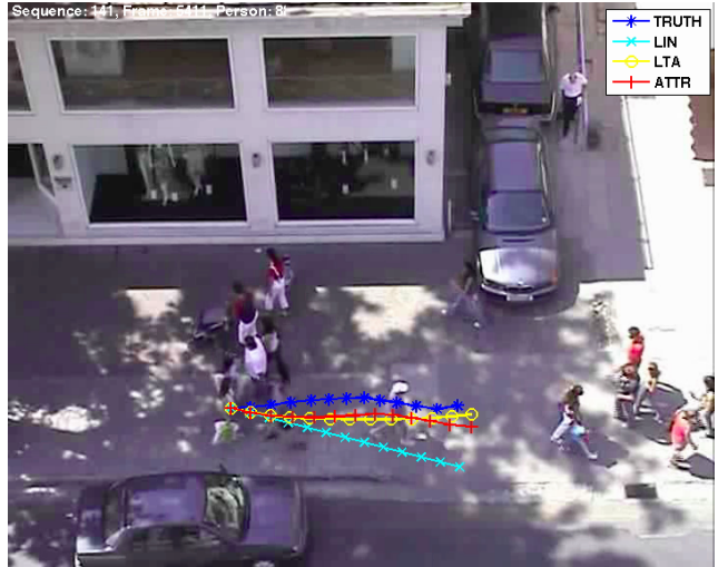
Figure 1. Example of behavioral prediction

We evaluated the effect of our behavioral model in a tracking application. Having in mind a video surveillance