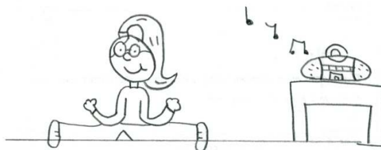
Non-team physical activity: Doing hip-hop is my favourite hobby because I love to dance (Girl, 12)