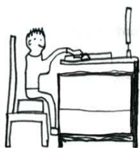
Media activity: I am playing on the computer. I like it because you can do things you can't in real world (Boy, 10)