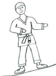
Non-team physical activity: I am at karate. I like going because my friends go (Boy, 10)