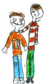
Extended family: My big cousin. He is really fun and I love him more than anything or anyone else in the world. (Boy, 11)