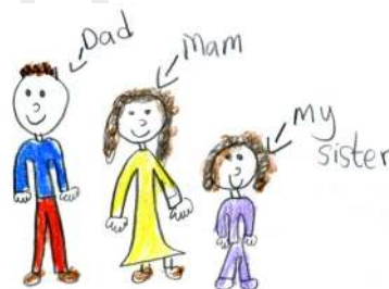
Parents: Because they love me. I love them more than they will ever know (Girl, 11)