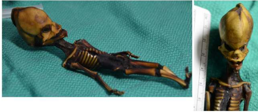
Figure 1. Mummified specimen from the Atacama region of Chile. Representative photograph of the 6-in skeleton (left) and frontal view of the skull of the Ata specimen (right).

genetic ancestry and sex determination, identification of disease- and phenotype-associated genes, and novel single nucleotide variation (SNV) detection.