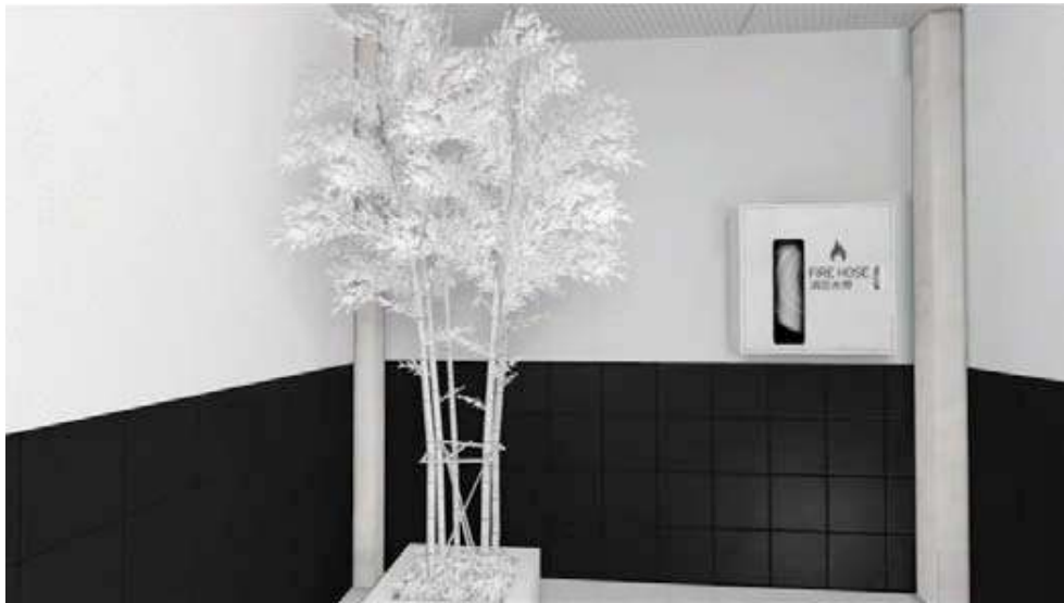
Figure 2: A pot plant and a fire hose box in Mirror's Edge , colored white due to their perceived lack of relevance in the Runner Vision schema.

However, Mirror's Edge does not show an objective, “transparent” visual representation of its game world. Rather, it represents the game environment in terms of Faith’s attention to it, in a stylized visual presentation referred to as Runner Vision . Most objects in the game world are depicted as blank white shapes, including some that would ordinarily be colorful, such as fire hose reels and leafy pot plants (see Figure 2); specific objects are colored, using a limited palette in which each color has an associated meaning for Faith. Faith alludes to this schema in a voice-over narration in the opening cut-scene: “Runners see the city differently than regular people and understand the natural flow.”