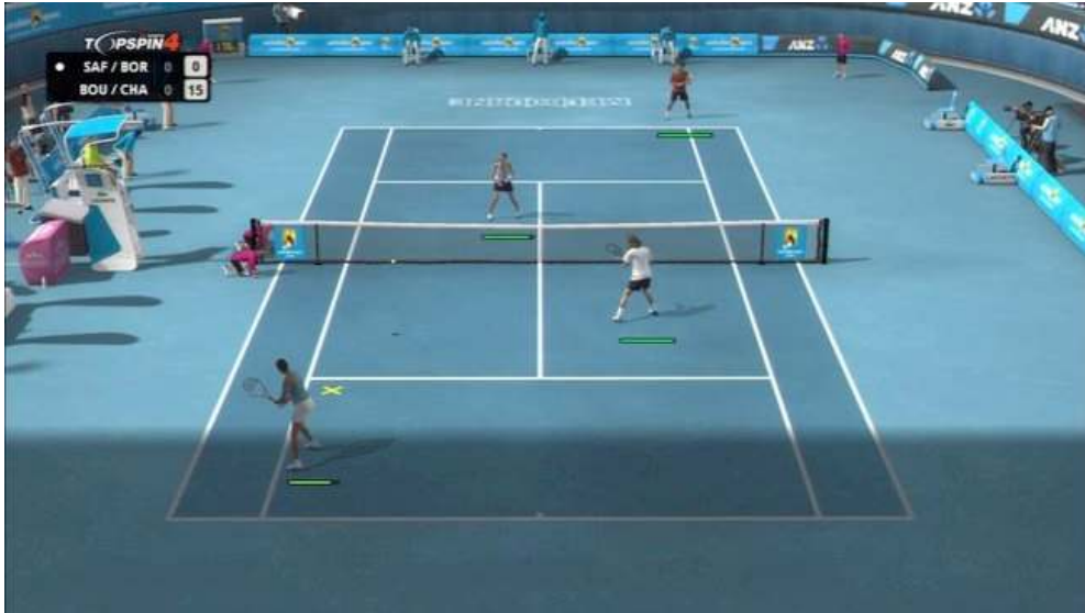
Figure 1: A yellow cross marks the landing point of an incoming ball in Top Spin 4 .

life players such as Roger Federer and Serena Williams. The player alternates between managing their character's career – choosing tournaments to play in and training programs to undertake through a set of menus – and controlling their character on the court, from a third person view that replicates the standard behind-the-baseline camera angle of televised tennis matches.