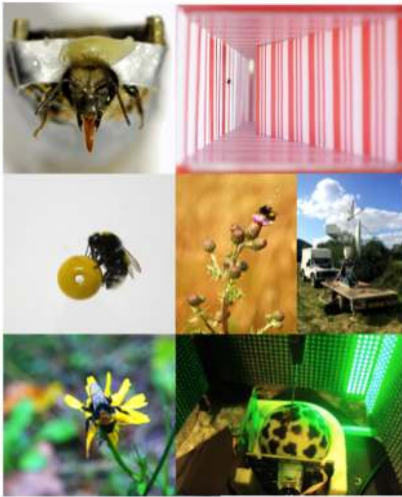
Figure I. Methods for Studying Bee Learning and Memory. (A) Restrained honey bee showing proboscis extension reflex (PER). (B) Free-flying honey bee in a flight tunnel covered with visual patterns generating optic flow [95]. (C) Bumblebee foraging on an artificial flower. (D) (Left) Bumblebee with a radar transponder in the field; (Right) harmonic radar. (E) Bumblebee with an RFID tag in the field. (F) Tethered honey bee walking on a locomotion compensator in a controlled visual environment displayed onto LED panels [97].