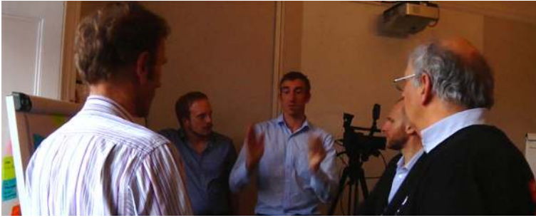
Fig. 2 Playframe opening: Participant starts speaking