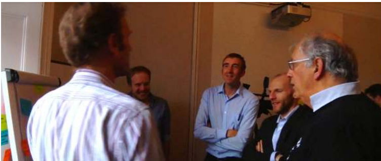
Fig. 4 Playframe ending: Laughter and different participant picking up the point made

the right to speak ‘truth’ to (institutional(ised)) power. The laughter, shared by at least two other group members, that follows his performance constitutes a form of mutual acknowledgement of the felt lack of control and influence over market-driven developers and thereby lends support to the participant (Fig. 4).