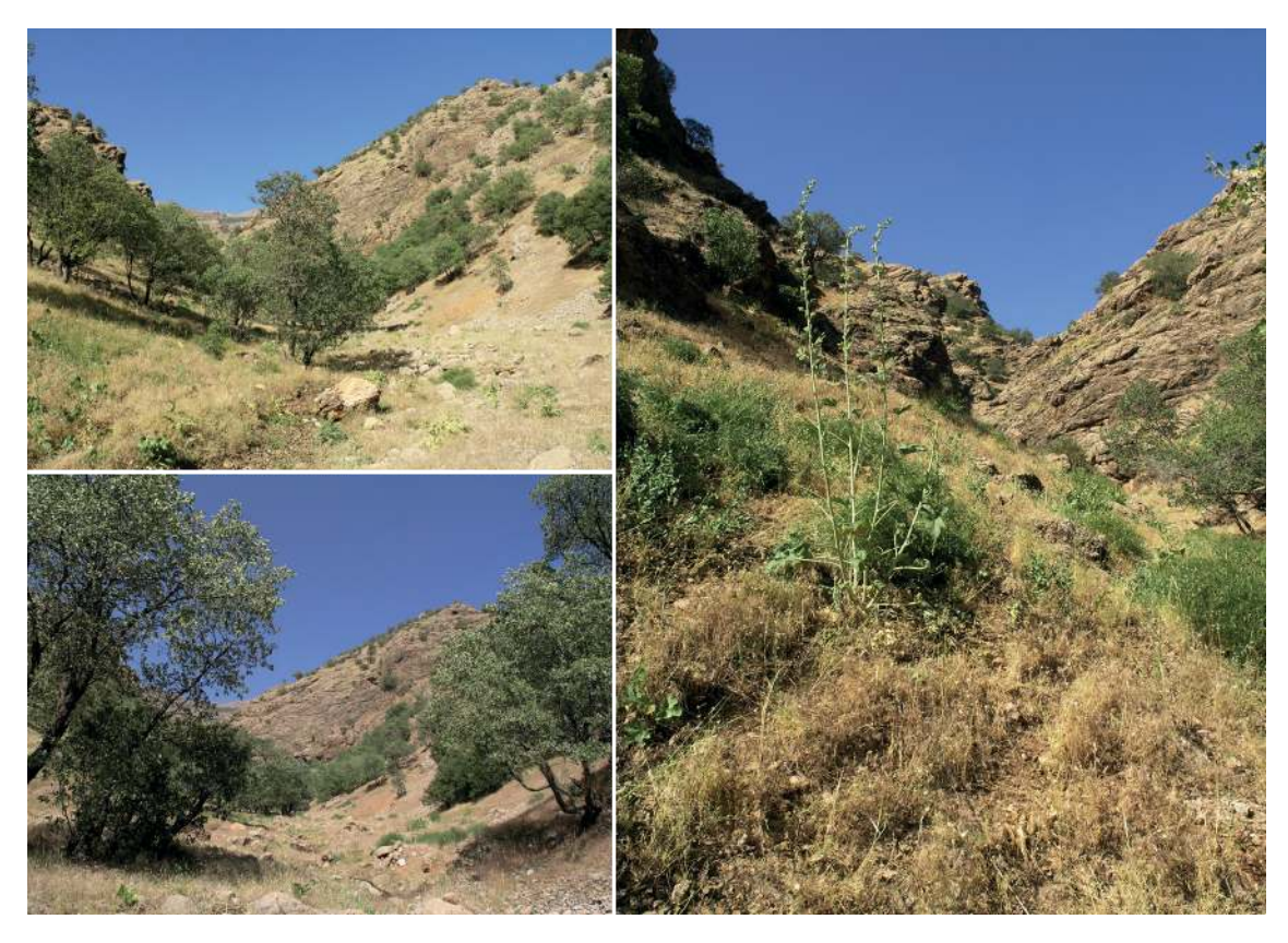
Fig. 3. The habitat of wild peas in Ostan-e Lorestan, Shakhrestan-e Khorramabad, Bakhsh-e Papi, 6.7 km NW of Istgah-e Bisheh village.

abad, Bakhsh-e Papi, 6.7 km NW of Istgah-e Bisheh village (broadly known as simply Bisheh), 33°22′12″ N, 48°49′34″ E, 1971 m a.s.l. (this is 85 km NW of the previous locality), in a rocky dell with a stony/detritous bottom with rock outcrops, its upper part becomes a small gorge between large cliffs (Fig. 3). The vegetation was dry Persian Oak stand; annual Poaceae, already withered, predominated in the grass layer. Wild pea plants occurred on the detritous bottom and at the base of the rocky right slope of the dell, in a stripe ca 110 m long but not more than 10 m wide; they alternate with plants