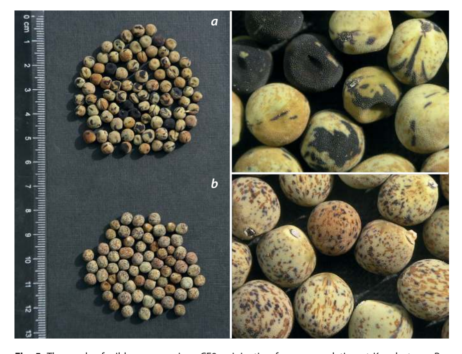
Fig. 5. The seeds of wild pea accessions CE9, originating from a population at Kagelestan-e Bar Aftab village ( a ), and CE10, originating from a population 6.7 km NW of Istgah-e Bisheh village ( b ).

to weevil oviposition (Berdnikov et al., 1992). In total 87 seeds were collected, of them 24 appeared infested by the pea weevil. One of those seeds gave rise to accession CE10 (= W6 56890 in the USDA GRIN).