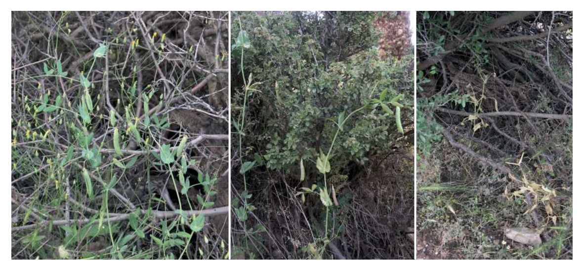
Fig. 2. Plants of P. sativum subsp. elatius of the population at Kagelestan-e Bar Aftab village.