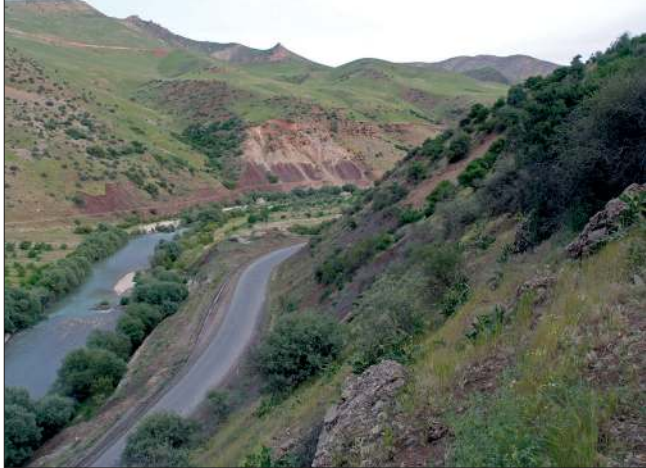
Fig. 1. The habitat of wild peas in Iran, Ostan-e Lorestan, Shakhrestan-e Aligudarz, Bakhsh-e Besharat, at Kagelestan-e Bar Aftab village.

49°39'23" E, 1841 m a.s.l. The wild peas were found in the lower part of the steep NW slope of the left (opposite to the village) board of the valley of the Rudbar-e Aligudarz River (a Dez River tributary). The slope had large rock (supposedly dolomite) outcrops and was covered with annual Graminea vegetation and sparse bushes of a wild almond Prunus scoparia Schneider (Fig. 1). About 40–50 plants were found on an area ca 10 \times 10 m at the bases of spiny almond bushes seemingly protecting them from being grazed by cattle, the paths of which were numerous on that slope. The plants were at the final vegetation stage, with the vegetative parts withered, pods ripen, about half of them dried out and about quarter of them dehisced (Fig. 2). In total 193 seeds were collected, 48 of which later appeared to be infested by the pea weevil (Bruchus pisorum L.). One of those seeds gave rise to accession CE9 (= W6 56889 in the USDA GRIN).