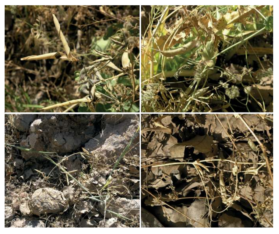
Fig. 4. Plants of P. sativum subsp. elatius of the population at Istgah-e Bisheh village.