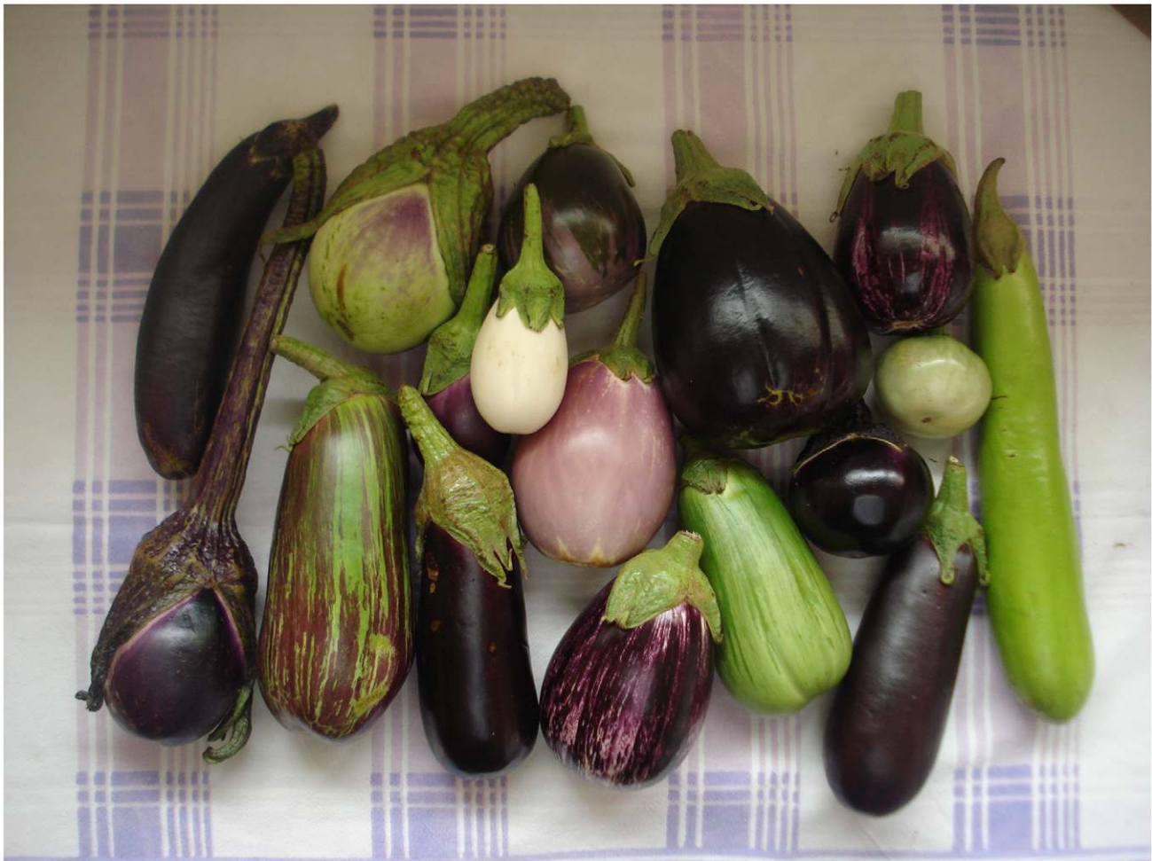
Figure 3. Fruit shape and colour variation in cultivars of the common eggplant, Solanum melongena .