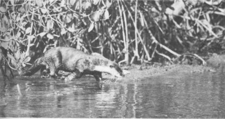
OTTER in the mangroves of the Lower Casamance National Park A. R. Dupuy

are the primary beneficiaries, and that the mud banks are good spawning grounds. But local people will have to be stopped from raiding the nesting bird colonies. Water birds abound, and in 1976 several flamingos Phoenicopterus ruber bred in the Sine-Saloum area. Reedbuck Redunca redunca have survived; these are manatees in the channels and some islands seem to be favoured nesting places for marine turtles – both situations to be investigated further.