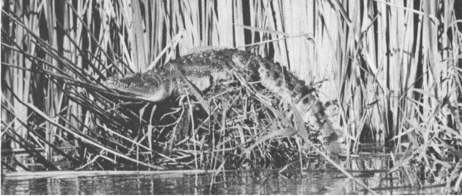
Crocodylus niloticus reintroduced in the Djoudj National Park A. R. Dupuy

central office in Dakar and with other parks in the country. While the suppression of elephant poaching is the first priority, there are other problems: honey gatherers may inadvertently start a savanna fire that destroys one of the large relict forests which act as excellent water-catchment areas, and herdsmen bring their animals into the reserve illegally, often from neighbouring countries. But the greatest threat is the proposed construction of dams on the River Gambia, upstream from the park. These are of arguable economic value, but the consequences for the park would be dramatic, for the greater part would be flooded. The authorities are conscious of the conflicting issues, and priority is not always given to immediate short-term profit. For example, a national highway, which until recently ran right through the park was diverted outside it and reconstructed completely.