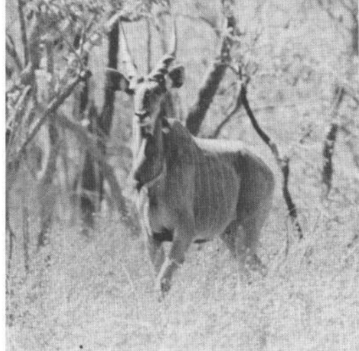
Lord Derby's eland A. R. Dupuy

Senegalese elephant only narrowly escaped total extinction, but the measures taken then yielded excellent results and numbers today are encouraging. However, since 1973–74 there has been a re-escalation of poaching, especially for elephants, often from neighbouring countries; without renewed and even more intensive efforts, the elephants of Senegal (which are in effect relict populations, with almost none coming in from neighbouring countries) will again be facing the gravest risk. Censuses of 1975 show that numbers have started to decline. To save the most northern and most western of Africa's elephants is thus the very highest of priorities. (Elephants have probably almost disappeared from Mauritania.) The population structure still seems relatively good with a fair percentage of young. They are relatively sedentary, at times very shy and sometimes very aggressive, and extremely sensitive to poaching, which disrupts the herds. Elephants have long disappeared from the west of Senegal, the last specimen on the Cape Verde peninsula having been killed as long ago as 1917 in the region of Thiès, 60 km north of Dakar, at a place called le Mont Rolland.