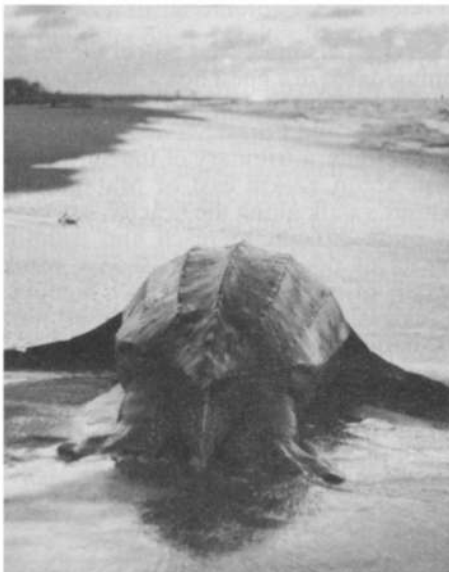
NESTING LEATHERBACK returning to the sea J. P. Schulz

The Surinam coast is important for many North American waders and may be crucial for some. Twenty species are regular visitors 9 , some on migration, others as winter residents. At any one time, there may be several hundred thousand lesser yellowlegs Tringa flavipes , short-billed dowitchers Limnodromus griseus or semipalmated sandpipers Calidris pusilla . This coast also provides exceptionally good conditions for other water birds such as scarlet ibis, egrets and herons. Spaans's aerial surveys in 1971 and 1972 along the 2000-km Guiana coast, between the mouth of the Amazon and the Peninsula de Paria in north-east Venezuela, located 21 mixed breeding colonies. Nearly half were on the 350-km Surinam stretch, including two of the seven scarlet ibis colonies, and the two accounted for over half the breeding pairs (approx. 20,000). In 1975 another aerial survey revealed three colonies in Surinam. For several species, including wood ibis Mycteria americana , jabiru stork Jabiru mycteria , roseate spoonbill, common egret and white-necked heron Ardea cocoi , the most important Surinam breeding colonies and feeding grounds lie