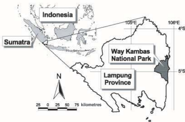
Figure 1 Map of Way Kambas National Park in Lampung, Sumatra, Indonesia.

Way Kambas National Park is located in Lampung Province in south-eastern Sumatra (Fig. 1). The 1300 km 2 Park has been identified as an important location for conservation because it is one of Sumatra's last lowland rainforests, contains significant populations of tigers, elephants and other endangered species, and is one of only six national parks in