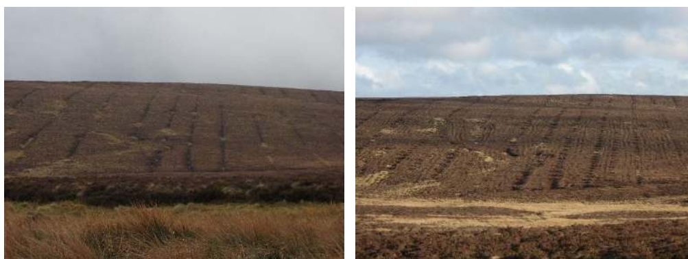
Figure 1: Drainage ditches before (left) and after (right) blocking on a blanket bog in North Wales, the ditches run down the slope and individual dams can be seen crossing the ditches.