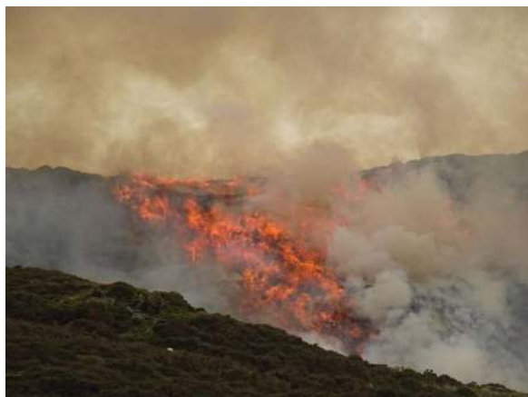
Figure 3: Burning of vegetation on peat in North Wales.