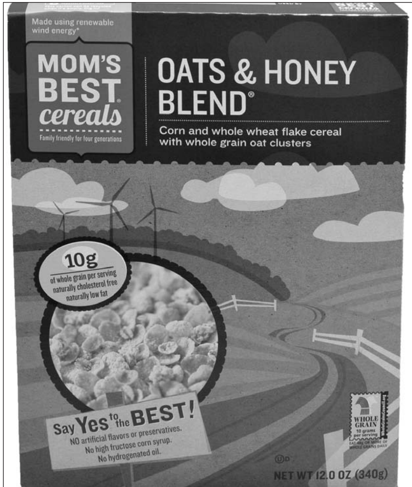
FIG. 1 Box of MOM's Best Cereals (2013).

objected to the “weakening of the cultural roots and conservative lifestyles that people have established there,” despite the abundant wind resources that make the turbines’ location so opportunistic. If completed, the project could have supplied about 7 percent of Scotland’s electricity needs. 43