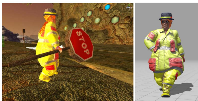
Figure 3 & 4: The Lollipop Lady NPC