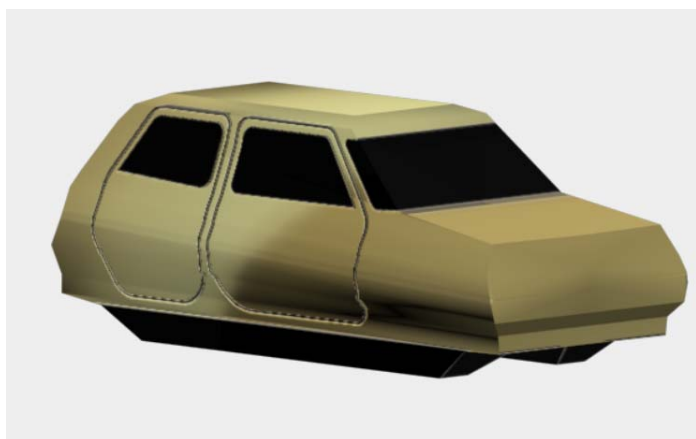
Figure 2: The 3D model of a car with a wood texture applied