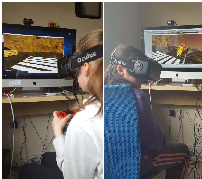
Figure 5 & 6: Children evaluating "Woodlands" during beta tests