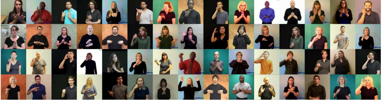
Figure 3: Illustrations of the diversity of our dataset, which contains different backgrounds, illumination conditions and signers with different appearances.