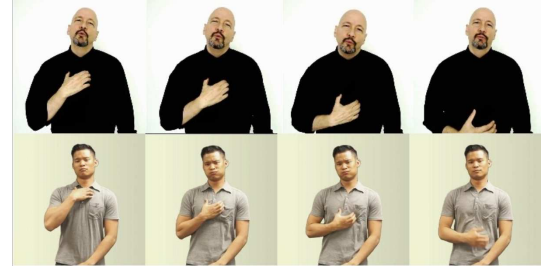
(a) The verb “Wish” (top) and the adjective “hungry” (bottom) correspond to the same sign.

In this section, we briefly review some existing publicly sign language datasets, and state-of-the-art sign language