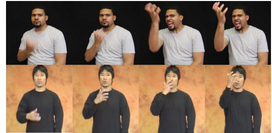
(c) Signers perform “Scream” with different hand positions and amplitude of hand movements.