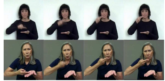
(b) The same sign represents different words “Rice” (top) and “soup” (bottom).