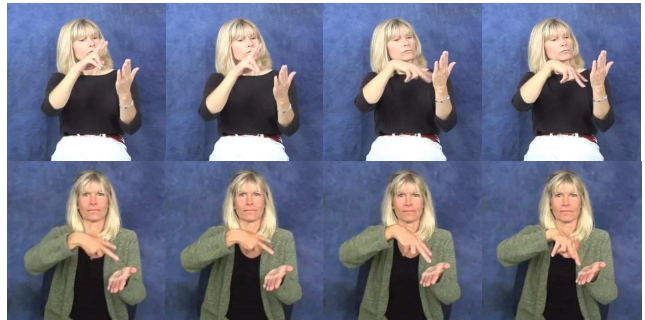
Figure 1: ASL signs “read” (top row) and “dance” (bottom row) [14] differ only in the orientations of the hands.

Sign languages, as a primary communication tool for the deaf community, have their unique linguistic structures. Sign language interpretation methods aim at auto-