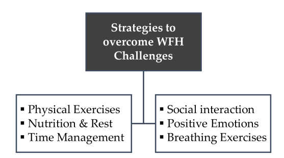
Figure 2. Strategies to overcome WFH challenges.

Overall, the participants of this study believed that behavioral coping and cognitive coping were two different ways to handle the mental health issues caused by working from home during COVID-19. Behavioral coping includes physical strategies applied upon oneself and the environment whereas cognitive coping encompasses the mental activities aimed to respond to stressful experiences. Figure 2 summarizes the strategies to overcome WFH challenges.