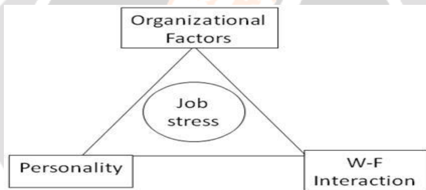
Table N. 1. Causes of Stress:

1.4 Causes of Stress: Causes can be broadly divide in to three,