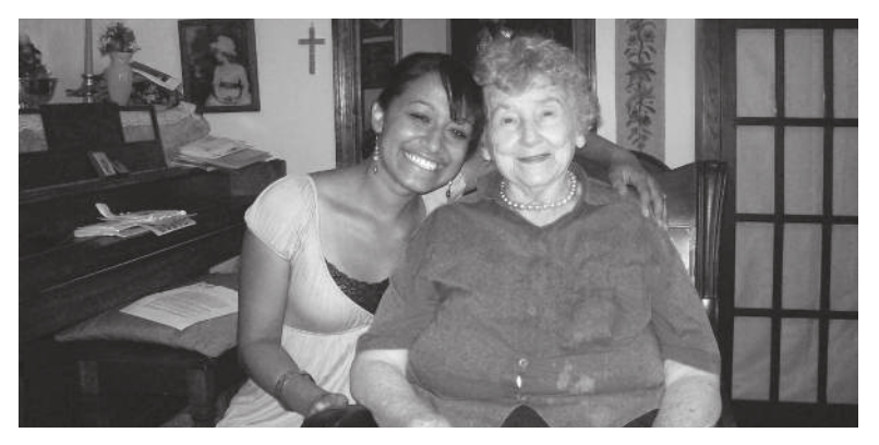
No Generation Gap