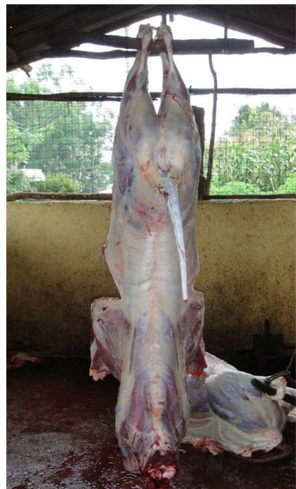
Fig. 3 Internal appearance of a category C cattle slaughterhouse in western Kenya