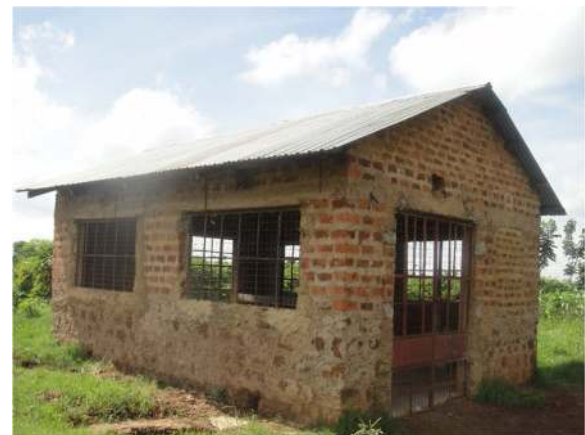
Fig. 2 External appearance of a category C cattle slaughterhouse in western Kenya

Table 1 details the results of the questionnaire and Table 2 the observations regarding the infrastructure