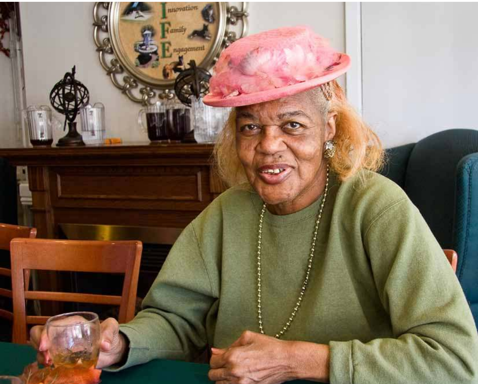
Six women at this Silverado Senior Living residential Alzheimer's community in Texas, USA, were taken by staff members to a flea market to select and purchase a hat. The next day a special table was set for them in the dining room. Each woman arrived, sporting her new hat or was helped to put it on. They all had a good time.

The effectiveness of health systems in identifying people with dementia depends upon the potential consumers, as well as the providers of health and social care. Encouraging help-seeking by raising awareness of dementia is an essential component of any comprehensive strategy to close the treatment gap. However, increased demand needs to be met by adequately prepared and resourced services, trained and able to make accurate diagnoses in a timely and efficient manner, and to ensure that the diagnosis leads seamlessly to the provision of evidence-based care. While acknowledging the importance of promoting demand for services, the focus for this chapter is upon service responses.