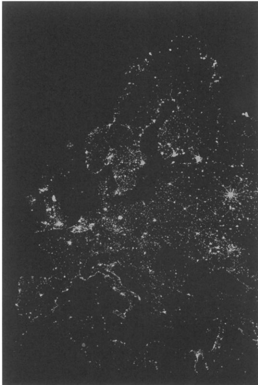
Figure 1. "Europe at Night," in which modern settlements appear as pinpricks of light.

This paper, which divides into six parts, reports preliminary research on the empirical groundwork required for describing the new metageography of relations between world cities. Such a modest goal is made necessary because of a critical empirical deficit within the world-city literature on intercity relations. In the first part, we show this to be a generic problem across all the different research schools within the literature. By concentrating on the attributes of world cities and neglecting their relations, we learn a lot about the nodes in the network, but relatively little about the network itself. In a brief second part, we introduce Castell's concept of network society, in which the world-city network does feature, and although this provides a conceptual framework for our research, the empirical problematic remains. Our particular solution to this data problem is to focus on the global office-location strategies of major corporate-service firms; in the third part, we outline this