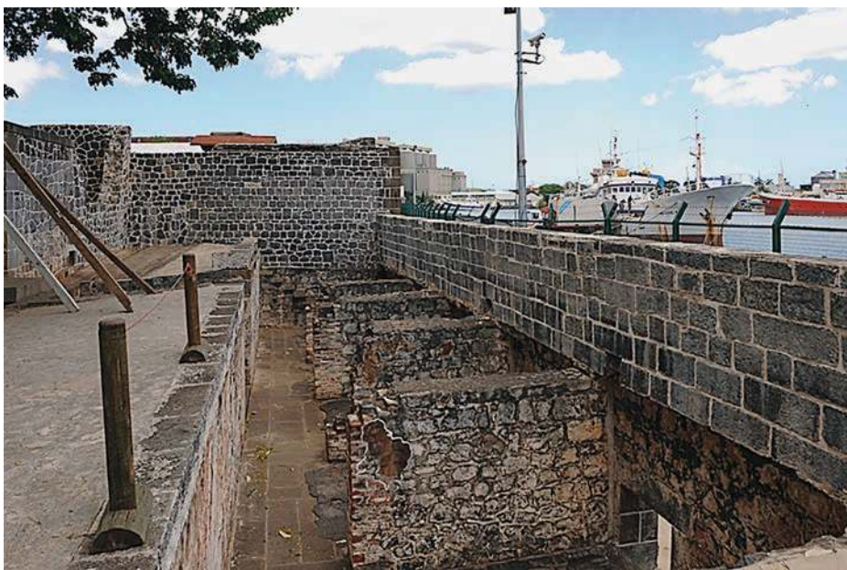
Fig. 1. Holding cells for arriving migrants. Aapravasi Ghat or immigration depot, Port Louis harbor.