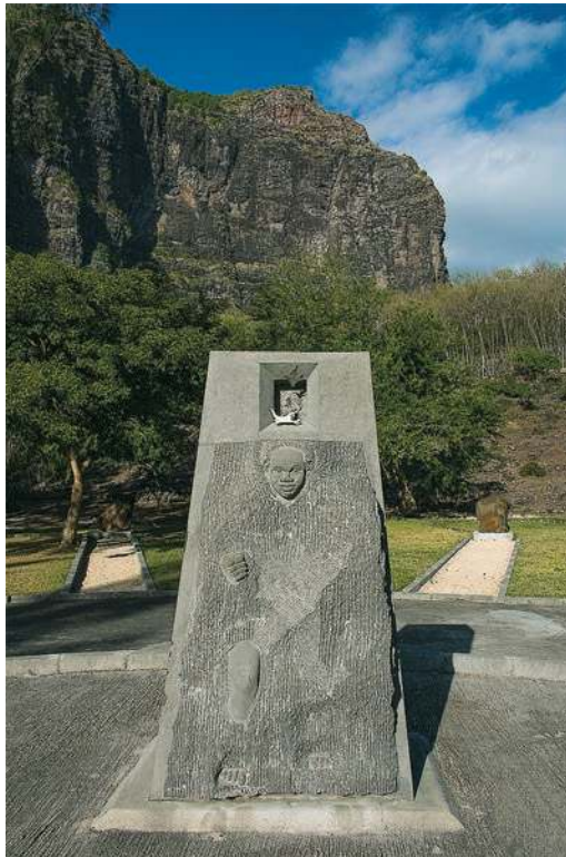
Fig. 4. Memorial to African and Malagasy maroons. Le Morne Cultural landscape.