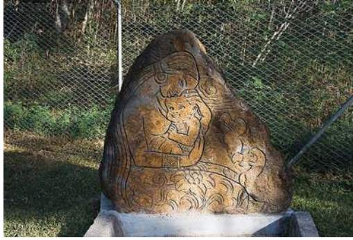
Fig. 3. Carved stone stele. Idealized memorial to maroon Indian female slaves, Le Morne Cultural Landscape.