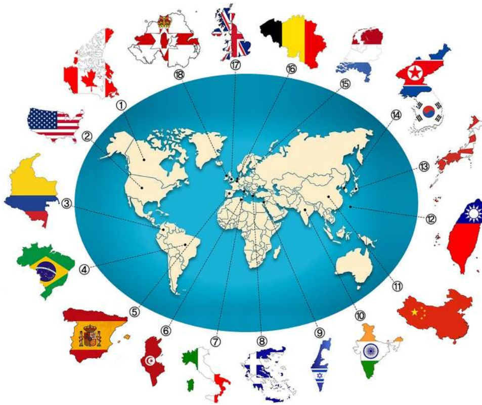
Fig. 2 Worldwide distribution of 254 reported Corynebacterium striatum cases of human infections and/or nosocomial outbreaks from year 1976 to 2020: Canada (1), United States of America (2), Colombia (3), Brazil (4), Netherlands (5), Belgium (6), United Kingdom (7), Northern Ireland (8), Italy (9), Spain (10), Greece (11), Tunisia (12), Israel (13), India (14), China (15), Korea (16), Japan (17), and Taiwan (18). Cases and/or outbreaks were reported in Europe ( n=124 ), Africa ( n=64 ), Asia ( n=36 ), South America ( n=17 ), and

North America ( n=13 ). Nosocomial outbreaks were reported in Belgium ( n=24 ), Spain ( n=21 ), Brazil ( n=14 ), Netherlands ( n=14 ), and Italy ( n=13 ). Multiple and single cases were reported in health units China ( n=1 ), Colombia ( n=1 ), Greece ( n=1 ), Netherlands ( n=1 ), Northern Ireland ( n=1 ), Taiwan ( n=1 ), Brazil ( n=2 ), Canada ( n=2 ), Korea ( n=2 ), India ( n=3 ), Israel ( n=3 ), United Kingdom ( n=5 ); Spain ( n=7 ); United States ( n=11 ); Japan ( n=26 ); Italy ( n=37 ), and Tunisia ( n=64 )