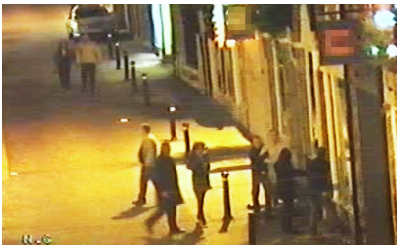
Figure 1c. The two bystanders are joined by others. A male bystander in a dark shirt and jeans pulls the main aggressor from his target, while a female bystander steps between the conflict parties and extends both arms out in a blocking motion.