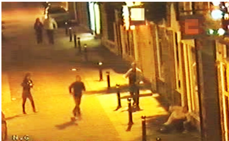
Figure 1b. To the bottom left-hand side, two bystanders leave their standing positions and approach the conflict parties.