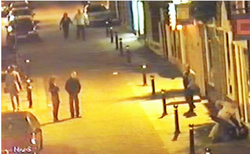
Figure 1a. On the bottom right-hand side, a man dressed in a white shirt assaults another man who is on the ground. Some bystanders observe.