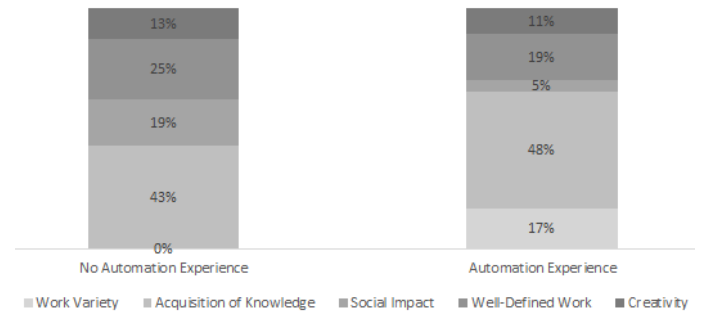
Figure 3. Importance of Factors for professionals with experience with test automation

Further, considering the experience with test automation, we observed that the general scenario is similar to participants that have worked or are working with techniques of automation, regarding the level of importance of each of the five factors. However, to those participants with no experience with automation, there is a considerable change in the value of these factors. This group of participants does not consider Work variety as an important factor, and they consider Social impact more important for their motivation than Creativity . This information is summarized in Figure 3.