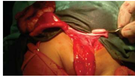
FIGURE 4: Right tuboovarian mass and normal left ovary and fallopian tube.

were within normal limits, and urine culture showed no organism. Alpha-fetoprotein value was 11.45 ng/mL (normal value: 0–15 ng/mL). Other tumor markers like CA 125 and CEA were also within normal limits. On exploratory laparotomy, we found a right tuboovarian mass of size approximately 10 cm × 6 cm × 5 cm with distended small bowel loops and no ascites or pus in the abdominal cavity (Figure 3). We did right salpingoophorectomy of the patient and specimen was sent for histopathology reporting (Figure 4).