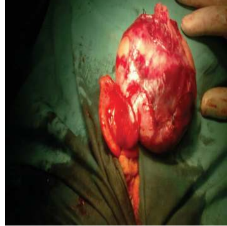
FIGURE 3: Exploratory laparotomy showing right tuboovarian mass.

Hematological investigation showed a hemoglobin of 6.0 gm%, total leucocyte count of 12,000/mm 3 with polymorphs 80%, lymphocytes of 20% and platelet count of 2 lakhs/mm 3 , and ESR 26 mm/hr, serum creatinine was 0.7 mg%, liver function test, urine routine, and microscopy