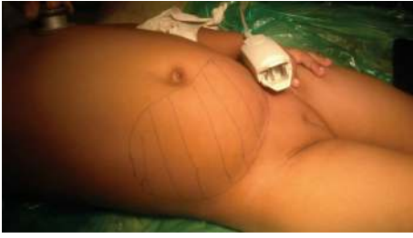
FIGURE 1: Clinical image with the outlining of the mass.