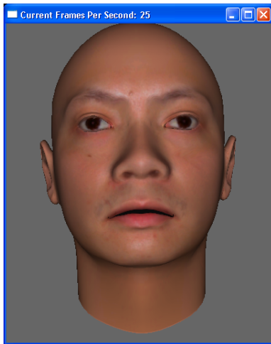
Figure 4: Sample shot from XfacePlayer.