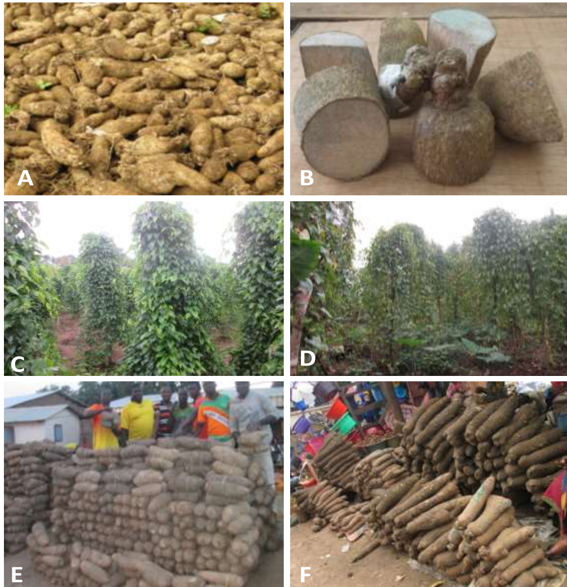
Figure 2. Some traditional seed yam systems, cropping patterns and ware yams marketing locations in Cameroon: (A) Small tubers selected for setts (Sorting); (B) 200-250g setts sliced from large tubers (junking), (C) section of a monocropped farm (D) yams intercropped with cocoyam, (E) section of a road side market at Mbe (Ngaoundere – Garoua highway), Adamawa Region (F) section of the terminal market at Bamenda, Northwest Region.

does not significantly improve the yield of the variety called Oshie white yam (Table 3). However, other studies indicate that in the Western highland the same cultivar ( Oshie white yam), produced better yields in the presence of inorganic (especially nitrogenous) fertilizer (Ngeve, 1998). Vernier (1998) reported that the application of inorganic fertilizer negatively affects the organoleptic properties of yam tubers, and also renders them more susceptible to post-harvest pests and diseases. Besides, many farmers cannot afford these fertilizers due to high prizes. This indicates the necessity