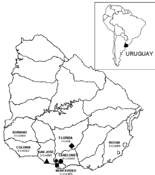
Figure 1. Locations of capture sites and enzyme-linked immunosorbent assay–confirmed hantavirus pulmonary syndrome case-patients in Uruguay. Capture sites: triangle = Puntas de Valdéz, diamond = Piedritas, circle = Sauce, star = Cerrillos, square = Melilla.

processing. The individual animals were tentatively identified in the field by external characteristics, and the carcasses were kept in 10% formalin. Identification was confirmed by cranial measurements and dental examination at the laboratory. All specimens were deposited at the collection of the Sección Zoología Vertebrados, Facultad de Ciencias, Universidad de la República, Montevideo, Uruguay.