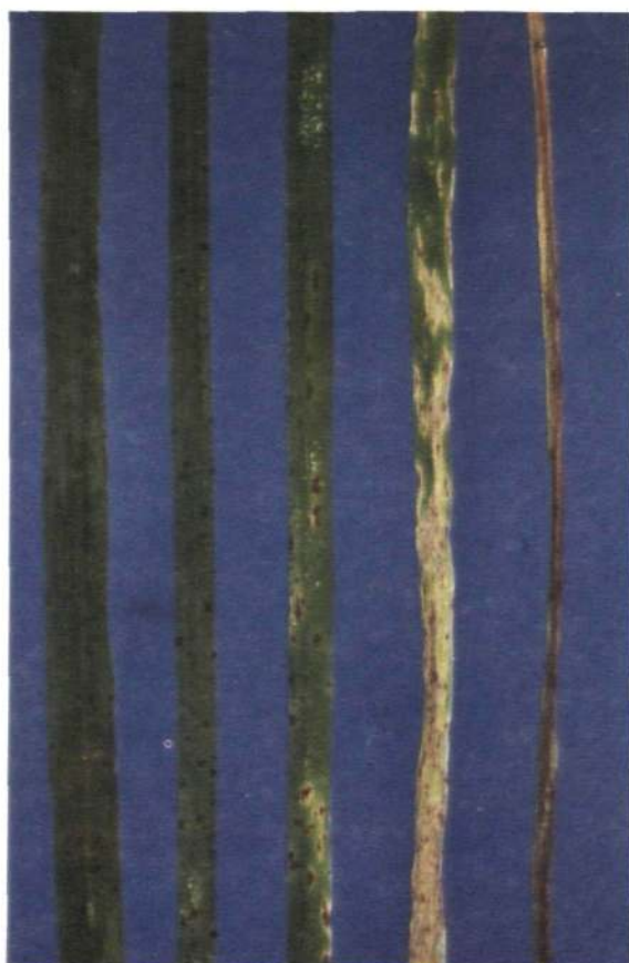
□ In the glasshouse, yellow spot symptoms on test lines of wheat ranged from resistant (left) to susceptible (right). Current commercial cultivars respond like those on the right.

growing lupins is a highly effective way of controlling cereal diseases, including yellow spot of wheat.