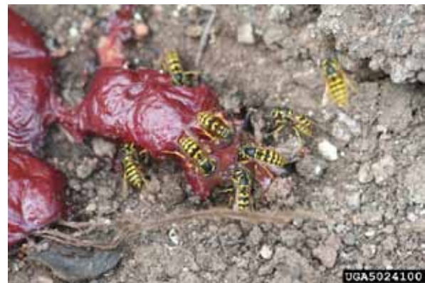
Fig. 7. Example of scavenging yellowjackets. 1