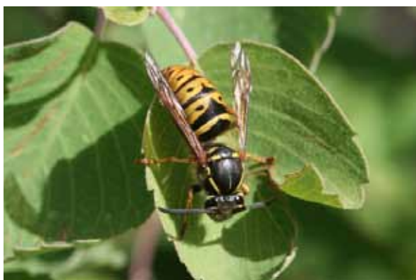
Fig. 1. Yellowjacket. 1

S ocial wasps, including yellowjackets, hornets and paper wasps, are common stinging insects in Utah (Figs. 1, 2). The wasps are related to ants and bees, which are also capable of stinging; however, yellowjackets are the most likely to sting. Less than 1% of people are allergic to wasp or bee stings; however, some people are fatally stung every year. Nearly 80% of all serious venom-related deaths occur within one hour of the sting. Most people will only experience a mild local reaction with redness, pain, swelling and itching at the sting site. If symptoms are more serious, a physician should be consulted. Some people may develop venom sensitivity after repeated stinging episodes over a short or long period of time.