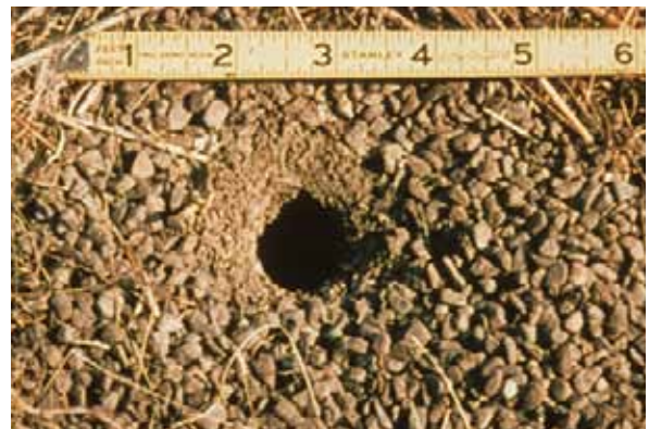
Fig. 5. Common yellowjacket nest opening. 1