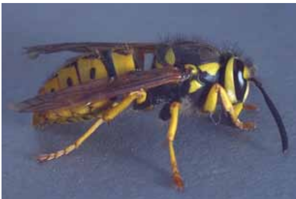
Fig. 4. Western yellowjacket. 1

Always try to avoid unnecessary stings, especially if family members are allergic, by minimizing potential contact with yellowjackets. Cover or eliminate garbage and other food sources. Never swing or strike at yellowjackets since quick movements often provoke attack and painful stings. Take care not to disturb underground nests when maintaining the lawn if possible. Never throw rocks or spray water into nests or attempt to burn nests. These actions could initiate a stinging swarm or cause unforeseen damage to the property.