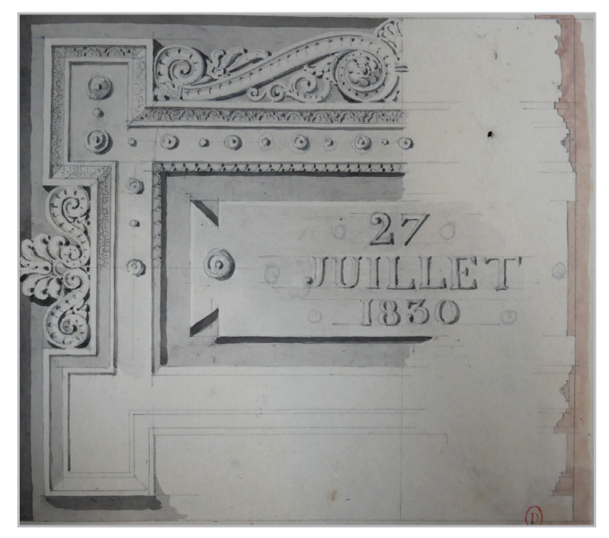
Figure 6. - Sketch for 1830s Room of Versailles, MS 823, National Institute of Art History, Paris © Justine Gain.