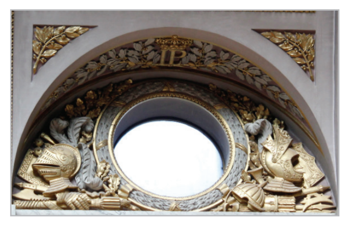
Figure 4. - Bull's-eye window, Great Battle Gallery, South Ward, Castle of Versailles © Justine Gain.

This gallery, due to its impressive dimensions, epitomizes one of the main advantages of using plaster in the palace: the ease of operating. For the larger part of the setting, Plantar carved his linear ornaments directly - mouldings, vegetal torus, ova, scrolls, etc. - in plaster prepared upstream. In other cases, he realised, probably in his workshop in Paris, some elements as the rosettes, obtained by means of a model cast in several exemplars, described above, or the military trophies made for the bull's-eye window. Besides the different techniques of moulding induced, using plaster also generated a specific logistic between a local production in situ and brought pieces needing a longer production process, in the studio. For these, Plantar used four different models – Greek, Roman and Medieval – from which Plantar obtained 44 exemplars for each side of the vault. He did the same for the King's figures and the bay leaves. Using plaster to adorn a more than 120 meters gallery was strategic, in that sense, it permitted to use casting and production in series from several models only in order to adorn efficiently.