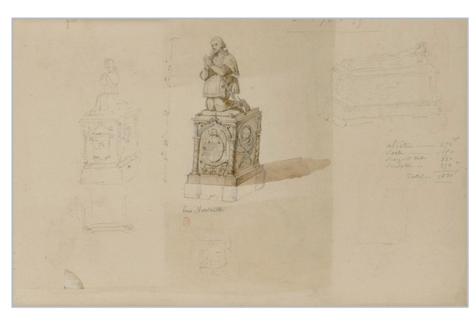
Figure 10. - Jean-Baptiste Plantar Album de dessins d'architecture et d'art décoratif , MS 675, view 40, National Institute of Art History Library, Paris.