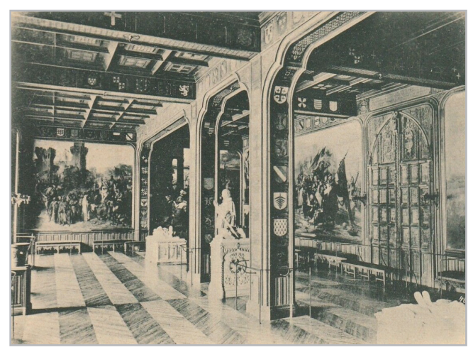
Figure 7. - The Great Crusades Room, Castle of Versailles, around 1900, postcard, private collection.

In the same manner, a few years later, the artist designed two other pedestals for recumbent sculptures, Pierre d'Aubusson [18] and Hugues Parisot de la Valette, again in plaster, as they are themselves. Louis-Philippe, indeed, had ordered François-Henri Jacquet (Maridet 2020), the official moulder at the Louvre Museum workshop, to stamp various funeral figures, mainly coming from Saint-Denis Basilic but also from Malta, which was the case for