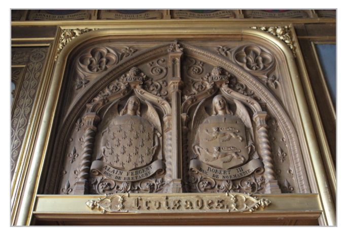
Figure 2. - Overdoor, Crusades Room n°1, North Ward, Castle of Versailles, Versailles © Justine Gain.

In two recesses, a pair of angels held what was to become crusaders coats of arms - which were not sculpted at that point, but to be realised later, directly on the actual piece, as they would be illustrating different Crusades characters for each room. The model completed, he proceeded to a hollow casting to obtain several prints, and, in this case, he made two prints for the two overdoors of the first room. These different steps, including different types of moulding, are entirely detailed in Historical Galleries archives, from the stamps of the Porte de Rhodes to the final installation of the overdoors [6]. This underlines the complexity of the process in conjunction with its cost, implying its administrative recognition in the bill. In the Crusades Rooms, plaster was used both to repair historical pieces, as well as to create similar gothic overdoors. In that regard, the material serves the revival aesthetic clearly displayed in Versailles, especially in this section, to make a gothic atmosphere made with authentic and imitated elements.