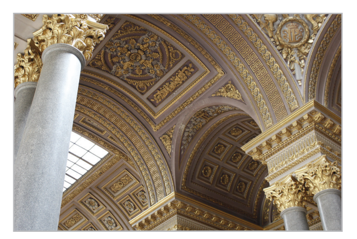
Figure 3. - Great Battles Gallery, Castle of Versailles, Versailles © Justine Gain.

ornaments on the ceiling, both supporting the same iconographic program related to war, represented through different eras.