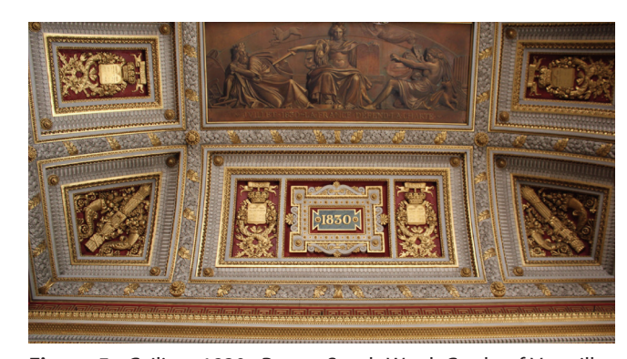
Figure 5. - Ceiling, 1830s Room, South Ward, Castle of Versailles © Justine Gain.

Following the iconographic program, the layout of the first-floor commands to the 1830's Room [Figure 5] [13]. Once again, the scenery achieved by Plantar is mainly made in plaster. One of the most remarkable patterns of the ceiling referred to the constitutional charter's date "1830", written in gold letters on a blue background. It celebrates the commencement of Louis-Philippe's rule, based on this charter. A sketch by Plantar, preserved at the National Institute of Art History [Figure 6], shows the primary project displaying the initial date set at the time: 27 July 1830, corresponding to the beginning of the Trois Glorieuses, three riots days that led Louis-Philippe on the throne. The idea was apparently withdrawn, perhaps due to political implications deemed too assertive. Plantar made another panel representing the charter itself positioned on a shield and topped by a royal crown. Below, two cornucopias, a laurel wreath completes the setting. One more, the plaster allowed Plantar to create his model in plaster, then print it, by hollow casting, in eight elements placed twice on each side of the 1830's Room, which was particularly appropriate for this ceiling composed by symmetrical ornamented compartments.