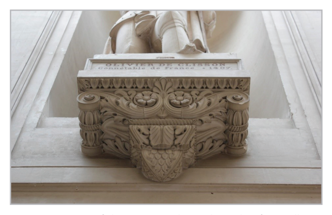
Figure 9. - Stairs of the King, North Ward, Castle of Versailles © Justine Gain.