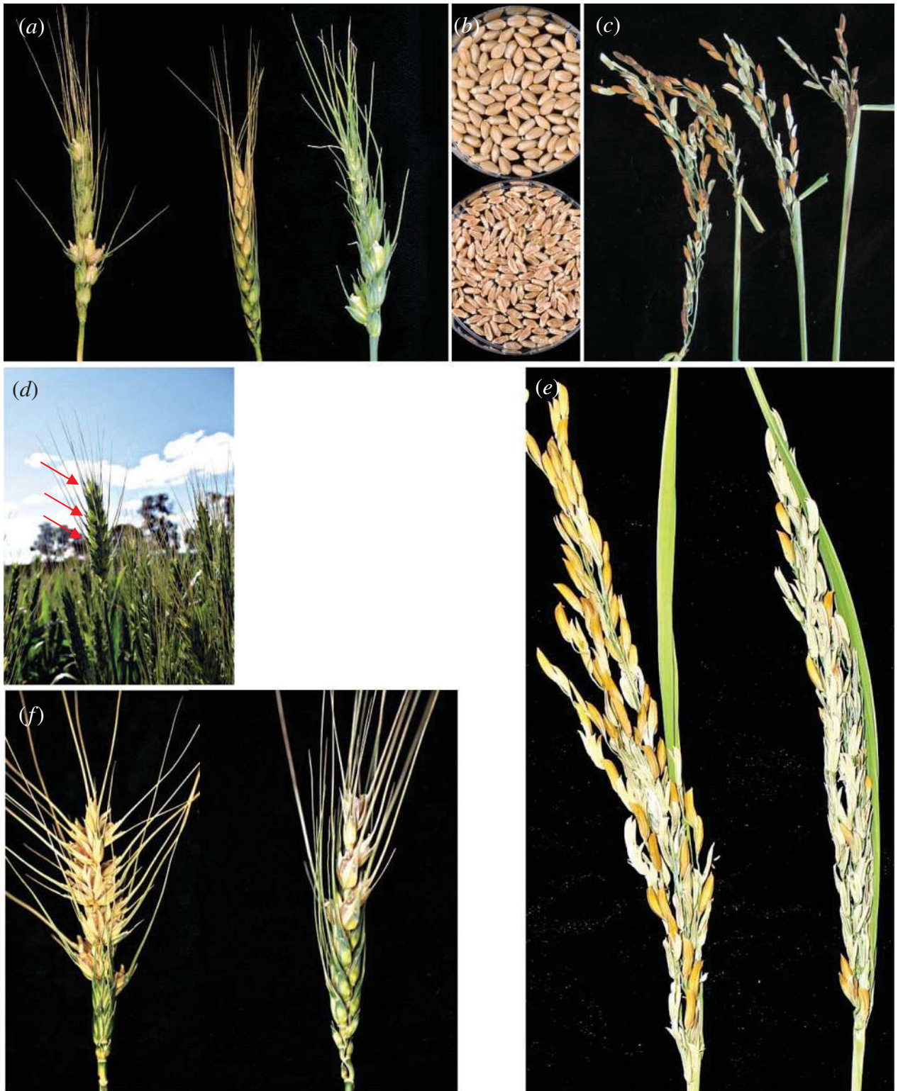
Fig. 1. Effect of abiotic stresses on cereal reproductive development. (a) Effect of young microspore stage drought stress (5 days; 40% relative water content) on grain number in wheat. (b) Drought stress at anthesis causes reduction in grain size in wheat. (c) Young microspore stage drought stress in rice causes reduction in grain number and in many cases the panicle fails to exert completely from the leaf sheaths. (d) Effect of young microspore stage cold stress in wheat. In the field, empty spikes (red arrows) are clearly visible against the bright background. (e) Young microspore stage cold stress (4 days at 12°C) causes massive reduction in grain number in rice. (f) Effect of heat stress (38°C, 4 days) at the young microspore stage in wheat.