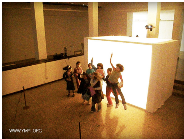
Fig. 4. Picture of users experiencing the YMYI artefact.

YMYI was setup on a conference room, shared with other conference activities. At the time of the performance, the computer running the software exhibited some latency to process the movements of the dancer, which were noticed and incorporated by the dancer in his performance. In his words: "My interaction with the machine resulted in a growing adjustment of both my sensitiveness and fine motor skills so that my body became more suitable to every movement to be projected onto the screens. The moving field for the image motion capture that I had at my disposal was a truly narrow space, which posed additional difficulties to my improvising dynamics and composition." He also reported that his interaction with the system posed him some challenges: the standard-slow motion capture of the sensor device compelled him to keep a low performance body speed and from that latency create an imaginative rhythm to keep an interest in both his displayed image and his movements. He stated that to take advantage of the system, he had to reinvent himself to develop thoroughly his whole composition.