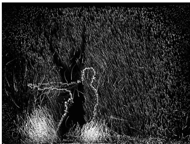
Fig. 1. The YMYI artefact.

YMYI motivation is to allow the performer to observe and give evidence to an artistic expressiveness developing in the mind an array of gesture ongoing instantiations. These physical expressive gestures are rendered in digital compositions formed by musical and visual movements, composing an enriched audio-visual experience.