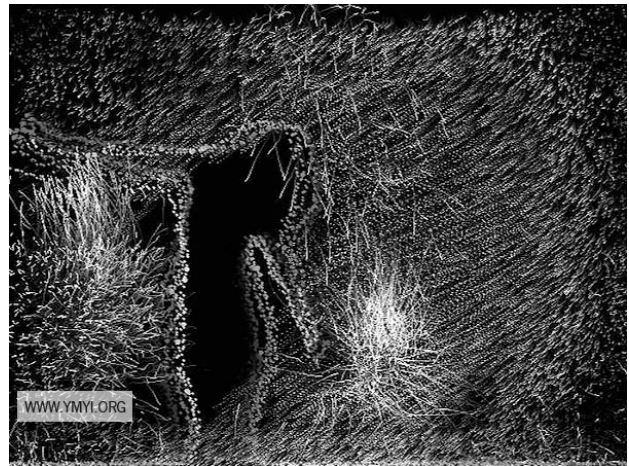
Fig. 3. The YMYI experience.

In the YMYI artefact, the human performer and the computer system engage in moulding visual graphics and computer music interactively in real time. The sound system of the artefact relies on the Software Super Collider (Website at: http://www.audiosynth.com/ ), an environment and programming language for real time audio synthesis. The system is proposed for automatic music performance based on artificial neural networks and its model produces a musically expressive variation of the control parameters according to all of the gesture dynamics. The sound exerts a reaction to the user's overall movements in the interactive space and it develops a set of associated parameters in intensity, duration and pitch, accordingly. The agent's continuous improvised flow of movements generates harmonic-related rhythms making possible for YMYI to exhibit a high-level mapping between the music, the graphic output and the agent's performance. Both the musical harmony divided in its discrete contours and the instantiation of the animated graphics in the digital scenery altogether with speed, velocity and trajectory of the user's movements, form a combining compound giving rise to an artistic involvement touching the YMYI universal expressiveness.