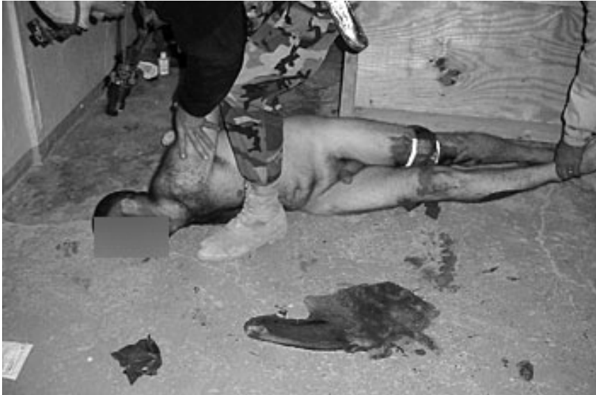
Figure 7. December 12, 2003. "Detainee after dog bite."

the Geneva Convention must be sanctioned if the United States and its allies are to succeed.