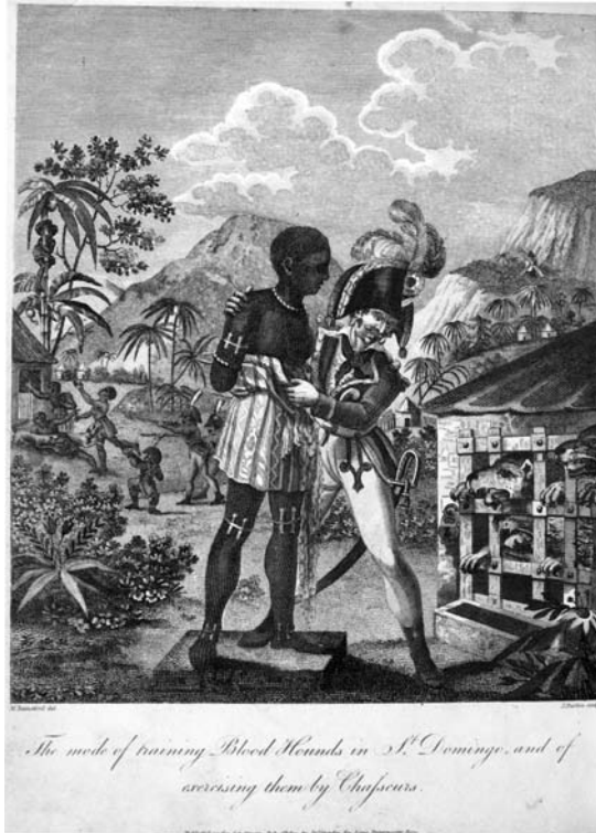
Figure 1. “The Mode of Training Blood Hounds in St. Domingo and of Exercising Them by Chasseurs” in Marcus Rainsford, An Historical Account of the Black Empire of Hayti (London: James Cundee, 1805).

A defenseless black figure is centered in the above image, arms bound and legs shackled. To his immediate right a uniformed white soldier holds him in place. The attention of both is riveted on a large cage in which several dogs lunge at their intended victim. The animals’ open jaws and sharp claws protrude menacingly, their restrained violence belying the tropical pastoral setting. In the background, armed soldiers corral several pleading figures outside of a small rural dwelling.