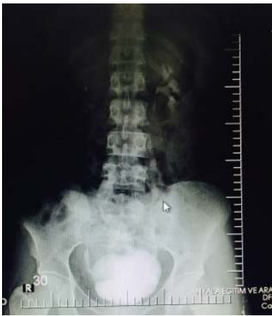
FIGURE 2: Intravenous pyelography image of urinary system.

no anatomical defects or significant leakage (Figure 2). Cystoscopy found the fistula focus on posterior bladder wall (Figure 3). During cystoscopy, catheter pushed through the fistula on posterior wall of bladder came out of cervical external os (Figure 4). After informing the patient and her relatives about the clinical situation thoroughly, laparotomy was decided. Since the patient wanted to keep her fertility intact, an extraperitoneal approach by Pfannenstiel incision was used to reach the bladder. The bladder was removed using O'Connor method and following the detection of fistula focus between uterus and bladder, necrotic fistula tract was removed and bladder and uterine mucosa were sutured shut by 2 layers of 2-0 polyglycolic sutures. Leakage control was done by administering sterile saline solution to the bladder and no leakage was seen in suture lines. An 18-Fr Foley catheter was placed into urethra and a drain was placed on extraperitoneal area. The drain placed on abdomen was removed 5 days after and urethral Foley catheter was removed 14 days after the spontaneous urination was normal and no leaks were detected.