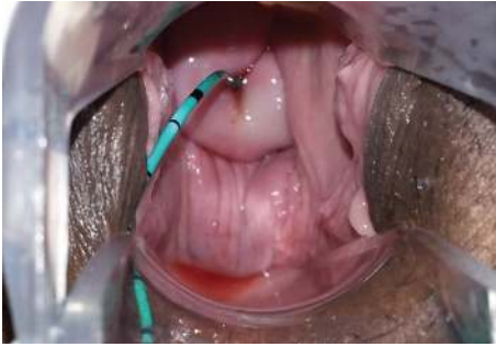
FIGURE 1: Fluid outflow consistent with hematuria from external os on cervical speculum examination.