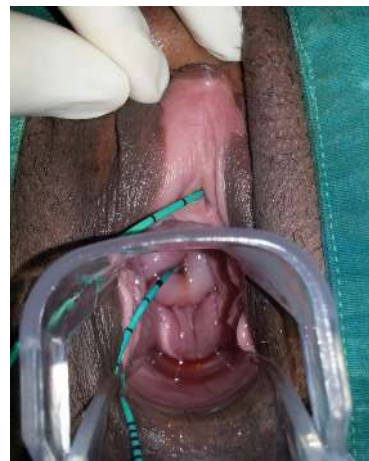
FIGURE 4: Exit of catheter stent through cystoscope to the fistula focus in bladder from cervical external os.

incontinence in a patient who had lower segment Cesarean section (LSCS) [4]. The VUFs are among the least common urogynecological fistulas. The VUF also occurs following high vaginal forceps-aided delivery, external cephalic version, curettage or manual removal of the placenta, placenta percreta, myomectomy, uterine rupture due to obstructed labor, uterine artery embolization, perforation of an intrauterine device, and brachytherapy for carcinoma of cervix. The LSCS is the single most common cause of VUF [3]. Amenorrhea, cyclic hematuria without urinary incontinence in combination with a history of LSCS, has been described as pathognomonic of VUF [5]. The clinical presentation is often nonspecific and findings on examination classically used to depict the fistula may be negative, leading to considerable delay in diagnosis [6]. The VUF may not manifest with constant urinary incontinence because of a functional sphincter at the internal uterine os. Urinary incontinence occurs if the level of the VUF is at or below the internal os or if the os is incompetent [5]. In our case scanty urine leak occurred even in the presence of competent os with fistula communicating with uterus above isthmus.