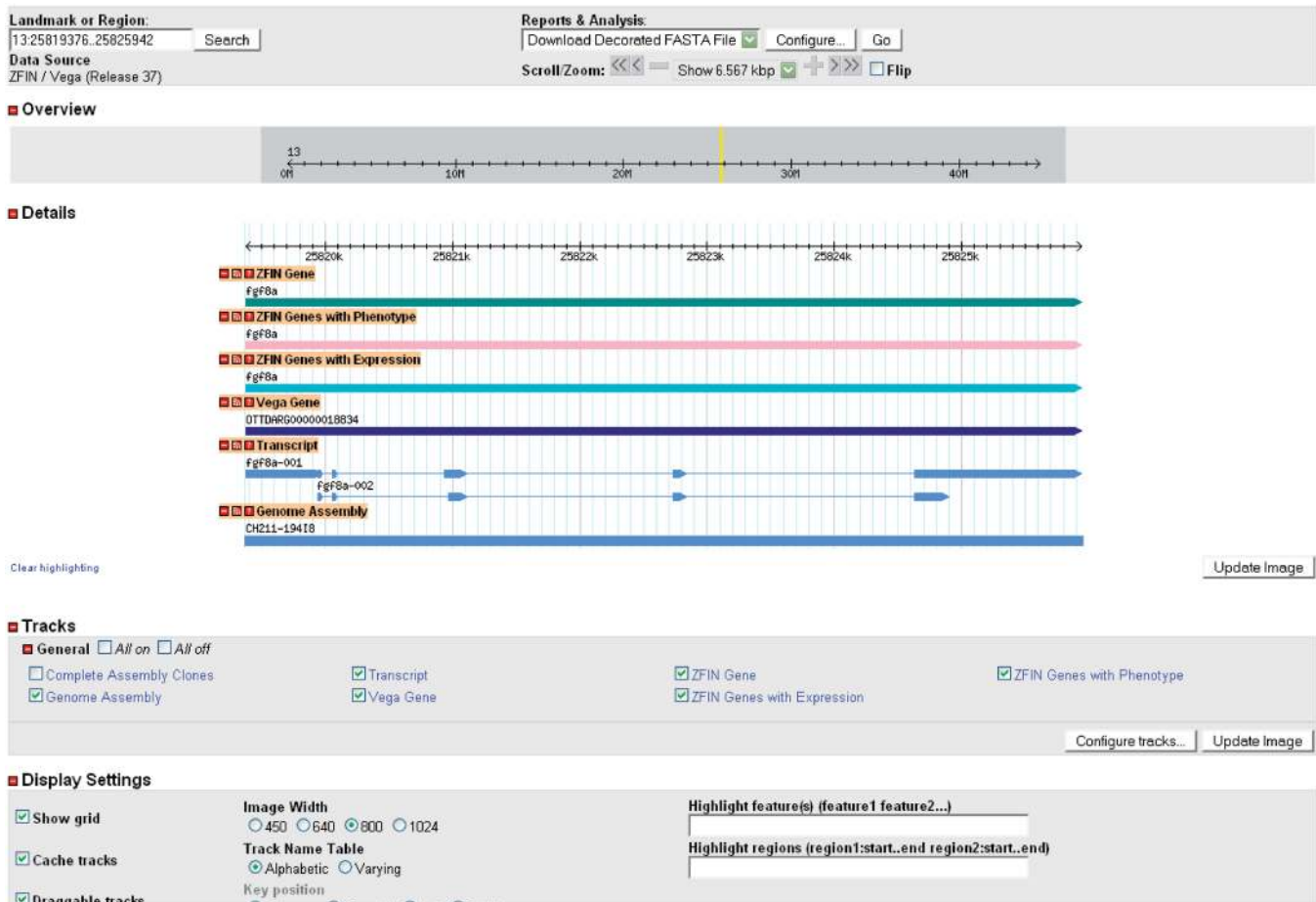
Figure 4. The GBrowse view of the genome, centered on fgf8a-001 transcript.

and antibodies to foster community collaboration and sharing in a centralized location. Community provided information supplements, but is not directly integrated with, the published data curated at ZFIN. Contributions provide useful practical tips such as RNAi hairpin design for zebrafish transgenics or preferred fixatives for antibody staining. The wiki format supports easy searching, record creation and editing. A table of contents, the most recent comments and a catalog of the most recently updated pages are also displayed. Login is not required to view information in the wiki. A login link allows registered users to login and contribute new records or comments. The adjacent sign up link can be used by new users to create an account. Instructions for adding new records and comments are provided on the home page for each wiki section (Figure 6). All wiki records can be viewed online or exported as PDF or Word documents.