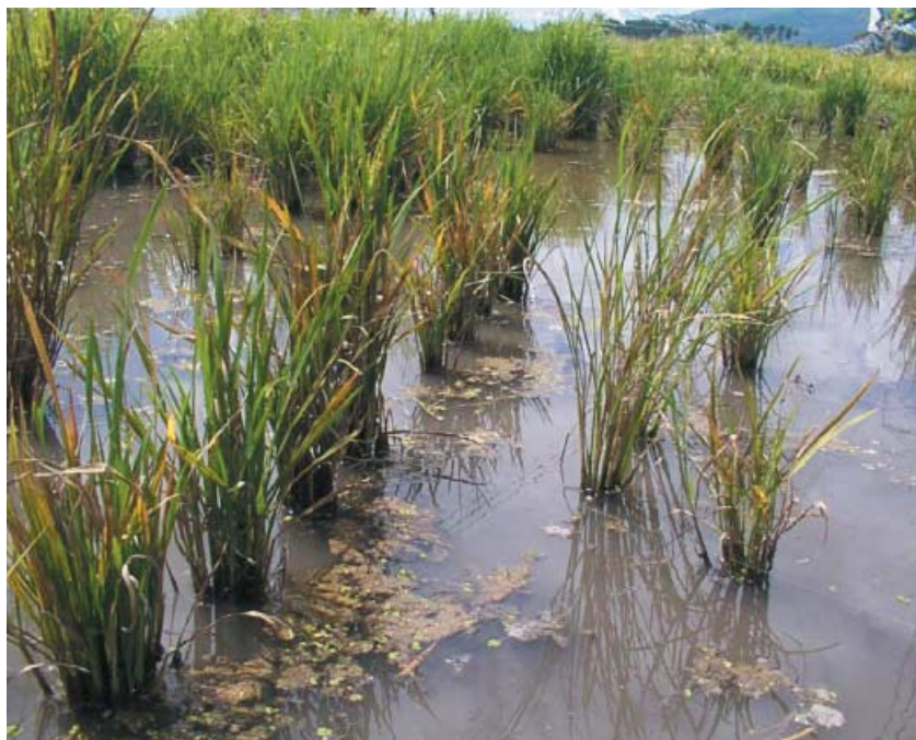
Fig. 1 Zinc deficiency induced by prolonged flooding in rice. Typical symptoms include high plant mortality, stuntedness, leaf bronzing and a delay in flowering.

in Zn uptake and tissue-use efficiency that exist within crop species (Rengel, 2001; Cakmak, 2002; Hacısalihoglu & Kochian, 2003; Alloway, 2004). For example, in rice, Zn uptake efficiency correlates with exudation rates of low-molecular-weight organic anions and a substantial proportion of the phenotypic variation in Zn uptake efficiency is under genetic control (Hoffland et al. , 2006; Wissuwa et al. , 2006).