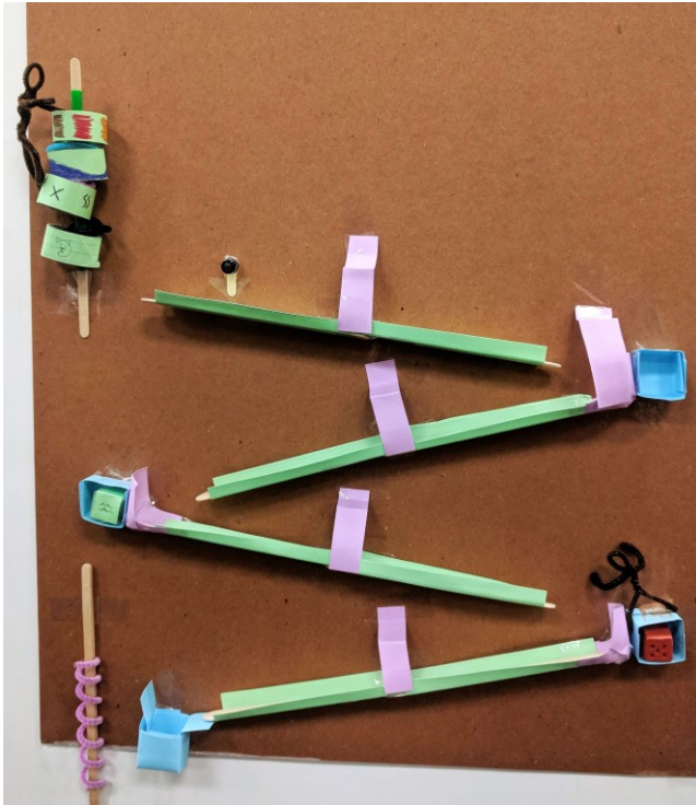
Figure 6: Marble run sound synthesiser for chimpanzees, 2018.