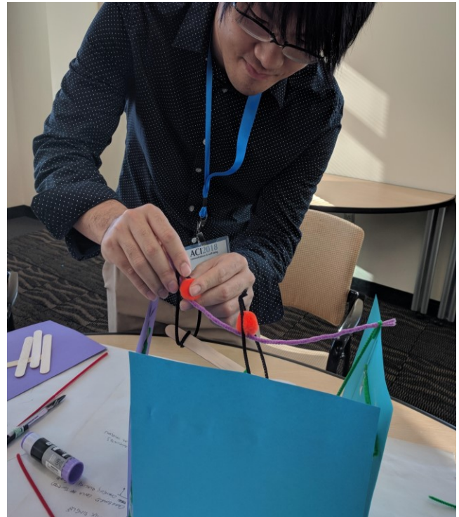
Figure 3: Crafting a musical toy for parrots, 2018.

After lunch, participants at the ZooJams were encouraged to reform teams based on the animal enrichment device that they were most interested in developing to a higher level of detail. Participants were under pressure to develop an idea with the potential to be successful as a future full-size prototype and research project, and the limited time factor was a motivator that also aided clarity of thought. It is a common experience of jammers that they can achieve tremendous creative outputs in a concentrated period of time, because they are working with no distractions in a supportive atmosphere with other focused people [13] [4].