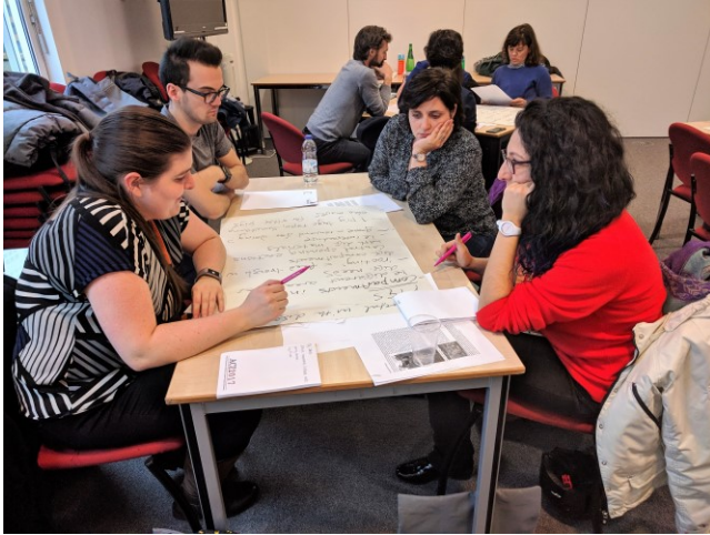
Figure 1: Participants in FarmJam 2017 - designing enrichment for pigs, poultry and goats.

In 2018, we used 20 minute pomodoros [22] for timing – a technique used for serial time management.