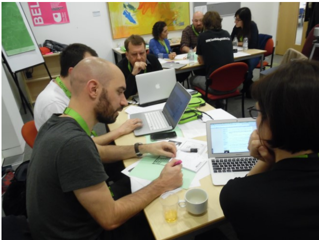
Figure 2: Participants in ZooJam 2016 - designing hunting experiences for zoo-housed carnivores - big cats, sea lions and penguins.