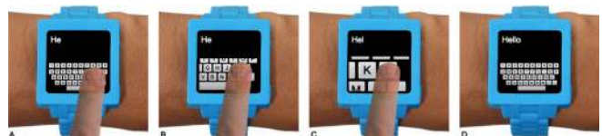
Figure 1: ZoomBoard on a watch-sized device. The keyboard is fully zoomed out by default (A). When users press a key, the keyboard iteratively zooms in (B & C), until the keys are a size that is comfortable and accurate (C). After the desired character is entered, the keyboard resets (D). Users may also swipe to the left to delete, to the right for a space, and up to switch to a symbols keyboard.

The most direct approach to support text entry on mobile devices has been to find clever ways to shrink QWERTY keyboards, such that they can be accommodated on mobile