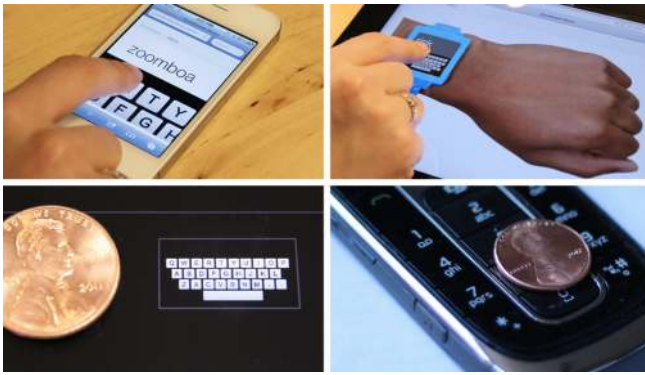
Figure 2: ZoomBoard could be used on a variety of device sizes, for example a smartphone (top left), watch (top right; simulated on a iPad), or coin-sized (bottom left). For size comparison, a typical physical number keypad (bottom right).

device enclosures and touchscreens [14]. However, fitting 27+ keys onto a small device is neither straightforward, nor particularly accurate. It is now standard for touchscreen keyboards to feature real-time spelling correction, simply because it is assumed that users are unable to accurately hit such small keys. However, this approach carries the significant benefit of being instantly familiar to users. Indeed, the latter property has been a driving factor in the consumer space, and most text produced today on smart devices is by miniature QWERTY keyboards. Further, given the number of keys required and our “fat fingers”, it seems unlikely a full keyboard layout can be shrunk much further.